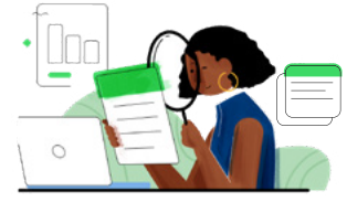
Prioritize those that have been historically marginalized