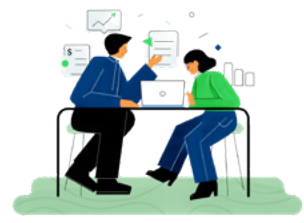
Strengthen BIPOC-led/serving and grassroots organizations