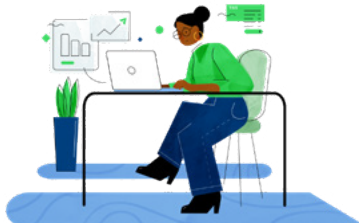
Help grantees build long term capacity