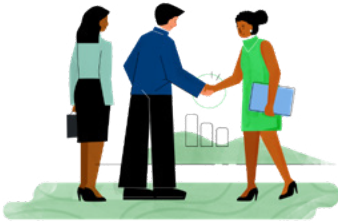
Meet changemakers where they are